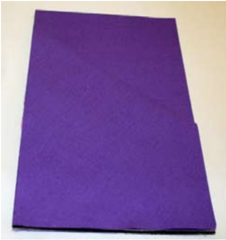
The trimmed pocket

Step 8 Satin stitch around all of the edges catching the pocket edges in the stitching. Use a wide stitch for this.